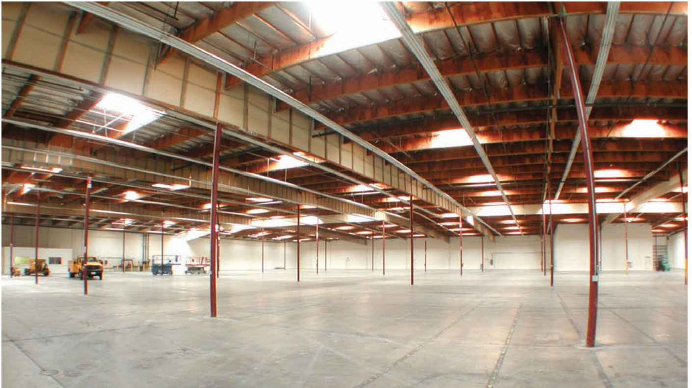
Here's the completed job. Lights are off, the hot spots are gone, and the space looks alive. Footcandles will average 79 instead of 30. At only $0.10 per kwh, the owner will save approximately $14,000.00 per year with a payback for this install in less than 3 years of pure after tax profit back to the company. Zero light energy also produces zero carbon emission. There isn't a more cost effective or energy efficient, green energy technology on the market today.