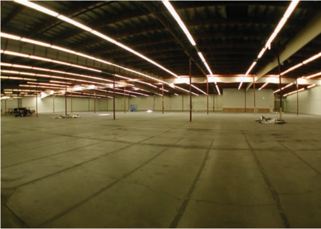
This photo taken with all electric lights on. The lights are 2-lamp 8' fluorescents, T-12s. These fixtures use 63.8 kw per hour to produce a light level of 30 footcandles.