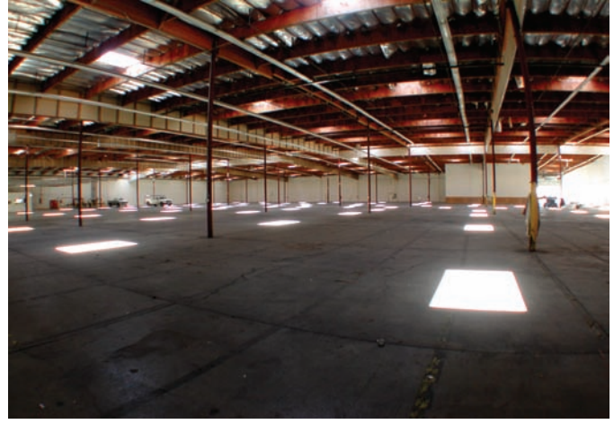
In this photo, all the skylight openings have been cut out and the electric lights are turned off. This is similar to what you find from clear glazed skylights. Daylighting is possible but hot spots cause glare and UV damage.